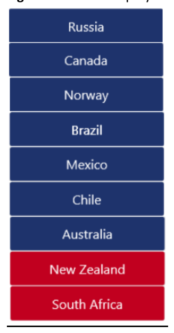
Fig 5. TrackMacro equity risk on and risk off signals for October 2019

TrackMacro also concludes that, according to macro fundamental indicators, most commodity exporters today exhibit an attractive equity value for risk.